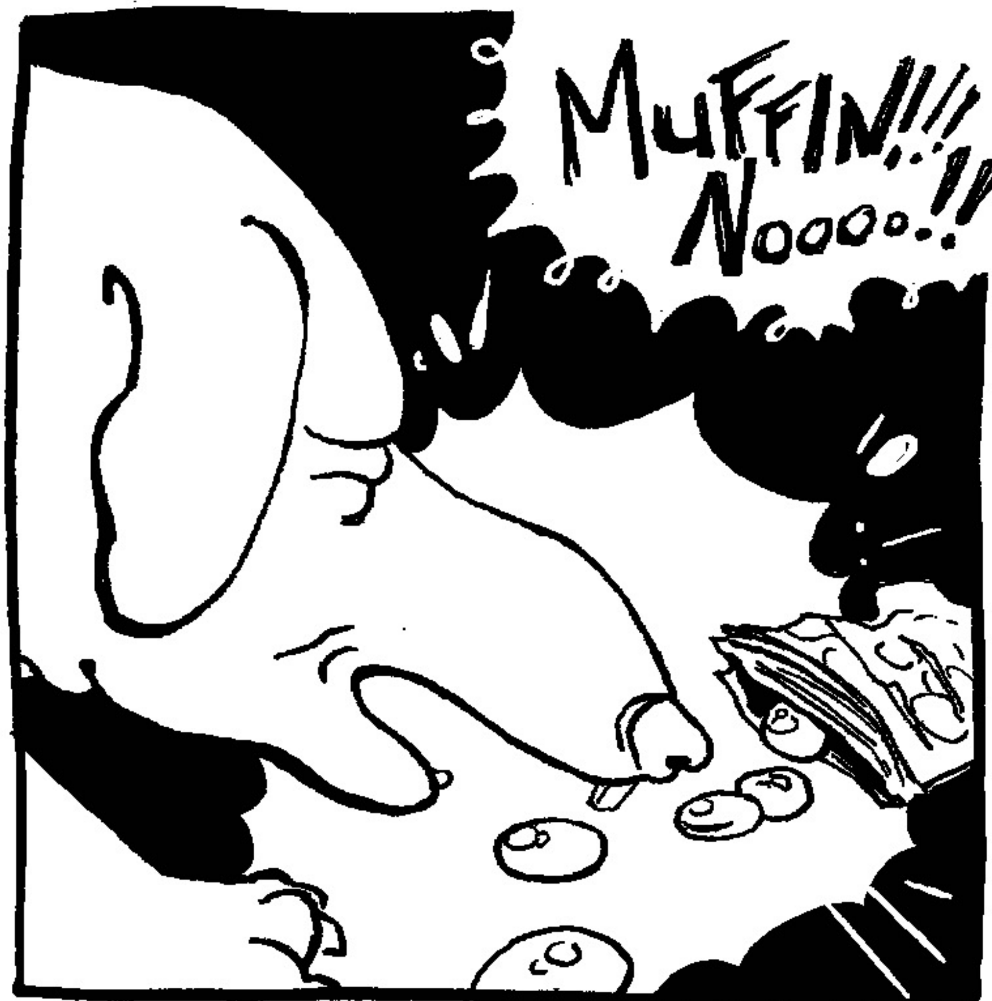
→ A Sweet Grape Treat ←